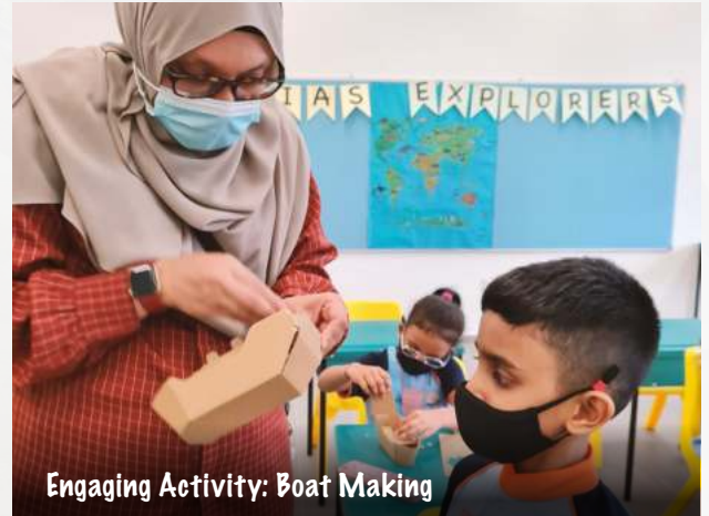
Engaging Activity: Boat Making