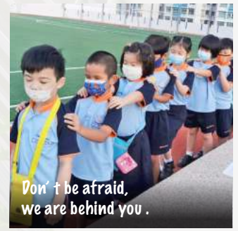
Don't be afraid, we are behind you.