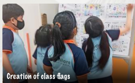
Creation of class flags