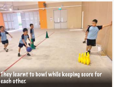
They learnt to bowl while keeping score for each other.