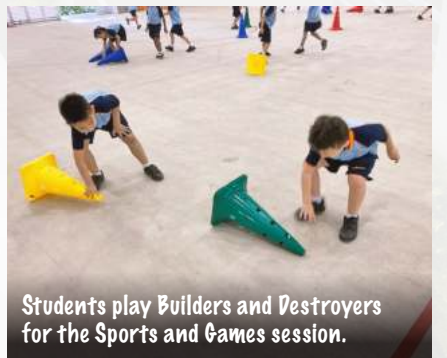
Students play Builders and Destroyers for the Sports and Games session.