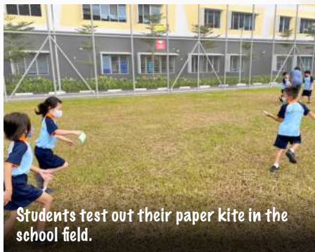
Students test out their paper kite in the school field.

All students went through the outdoor education sessions in Term 1 where they learnt to use their five senses to appreciate their surroundings. The sessions cultivated their social-emotional competencies such as self-awareness while learning to appreciate being in the outdoors. In Term 2, students went through a series of sports and games sessions. They learnt to play various forms of games such as cooperative games like Builders and Destroyers, and target games like bowling. The sports and games sessions also taught them skills such as perseverance and relationship management.