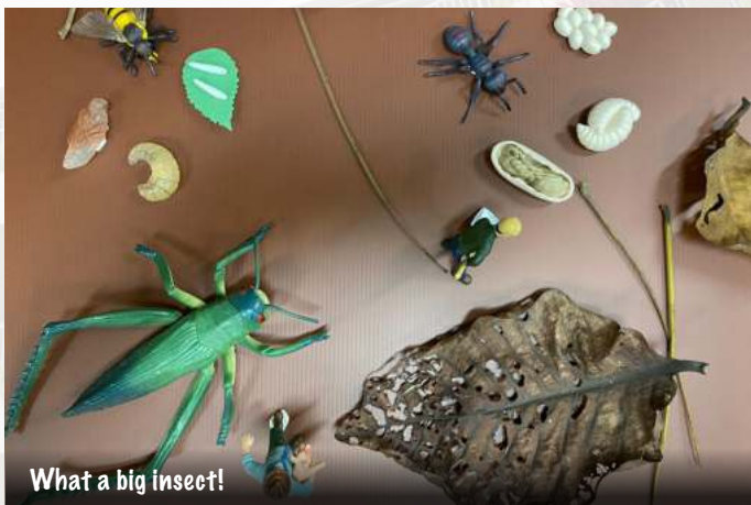
What a big insect!