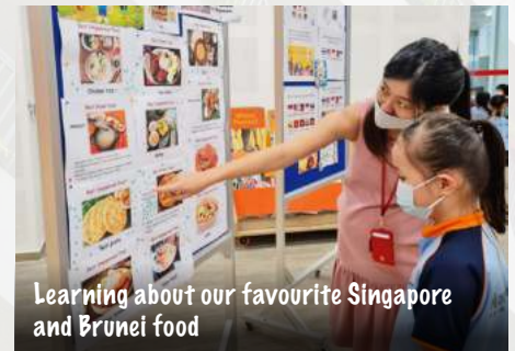
Learning about our favourite Singapore and Brunei food