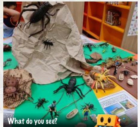
What do you see?