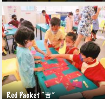
Red Packet “吉”