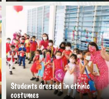
Students dressed in ethnic costumes