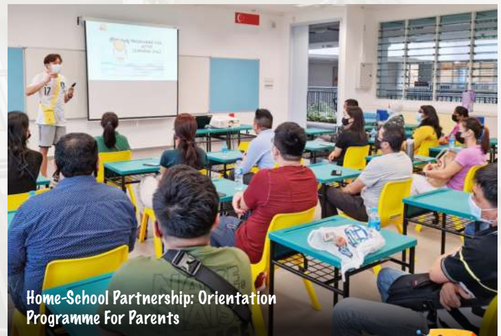
Home-School Partnership: Orientation Programme For Parents

Through the S.M.A.R.T Beginning programme and Parents' Orientation, we hope the students and their parents will have a smooth transition to primary school life and have the best six years of their education at Northshore Primary School!