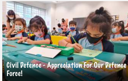
Civil Defence - Appreciation For Our Defence Force!