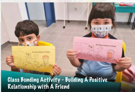
Class Bonding Activity - Building A Positive Relationship with A Friend