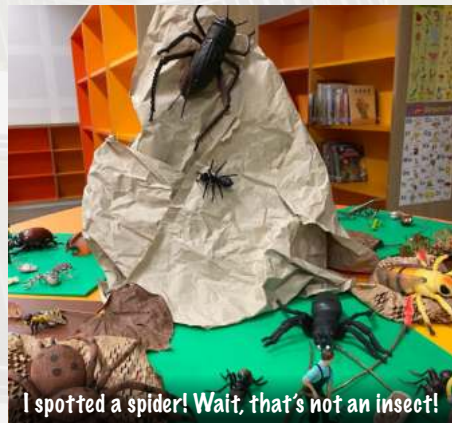
I spotted a spider! Wait, that's not an insect!