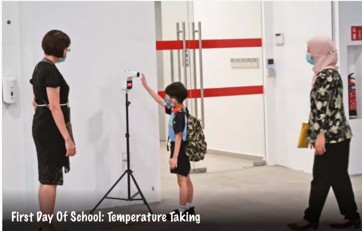
First Day Of School: Temperature Taking

On 4 January 2021, we welcomed our very first Primary 1 cohort into the Northshore family. The students were introduced to primary school life through a series of activities under the S.M.A.R.T Beginning - Learn and Grow Programme. Concurrently, the parents of our Primary 1 students attended various briefings and went on a school tour. Not only were the students excited about their new classrooms and the surrounding areas, but the parents were also equally impressed by the greenery and vast spaces that our school has to offer!