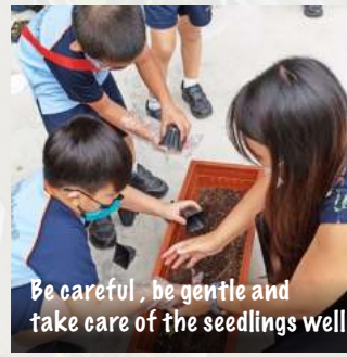
Be careful, be gentle and take care of the seedlings well.