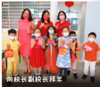
向校长副校长拜年

May 2021 be a great year for everyone at Northshore Primary!