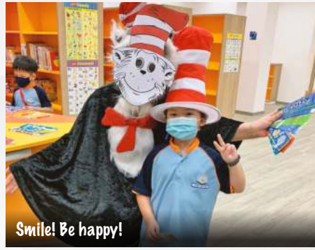
Smile! Be happy!