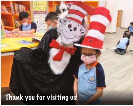
Thank you for visiting us!