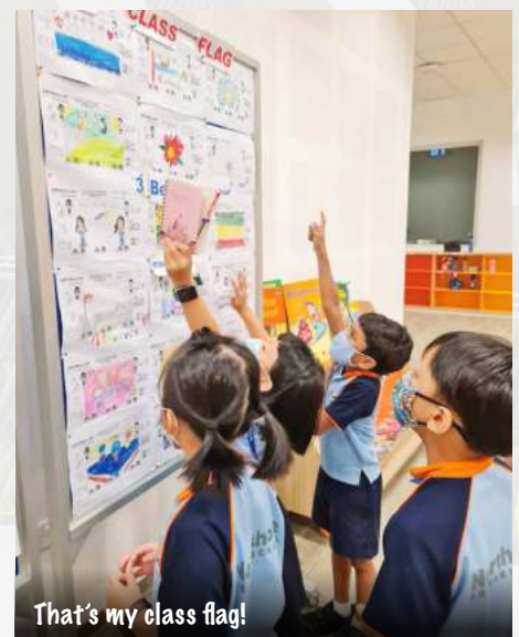
That's my class flag!