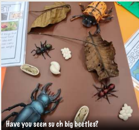
Have you seen such big beetles?