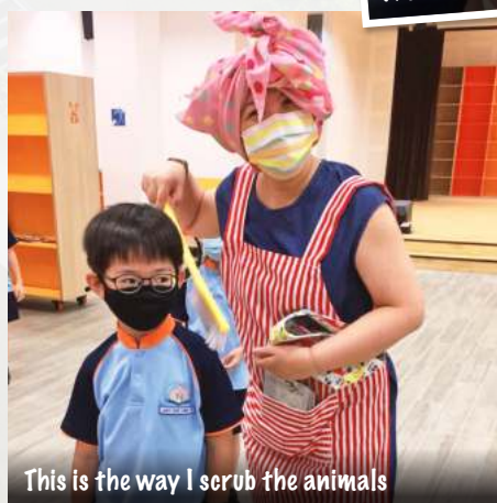
This is the way I scrub the animals