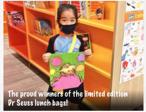
The proud winners of the limited edition Dr Seuss lunch bags!