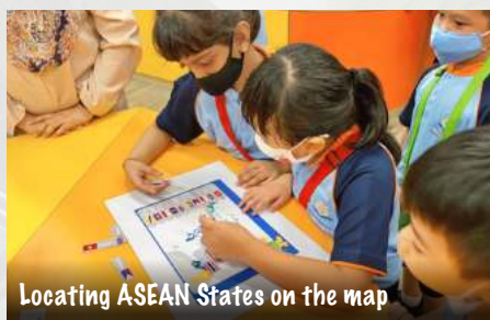
Locating ASEAN States on the map