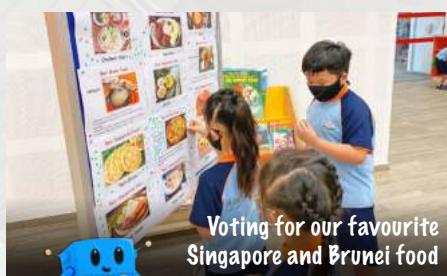
Voting for our favourite Singapore and Brunei food