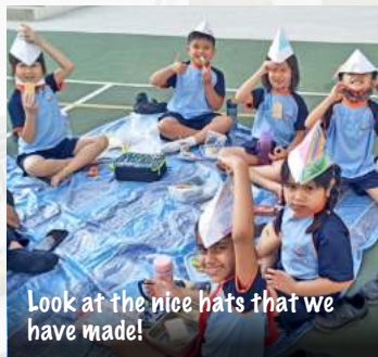
Look at the nice hats that we have made!