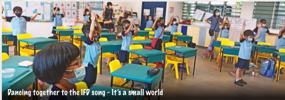
Dancing together to the IFD song - It's a small world