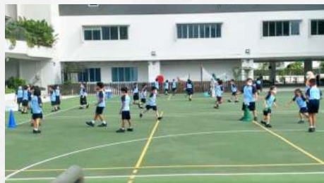
Recess Play at Level 1