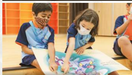
Enjoying a big book together