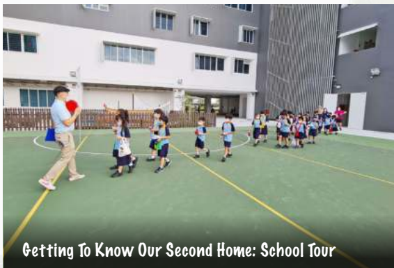
Getting To Know Our Second Home: School Tour