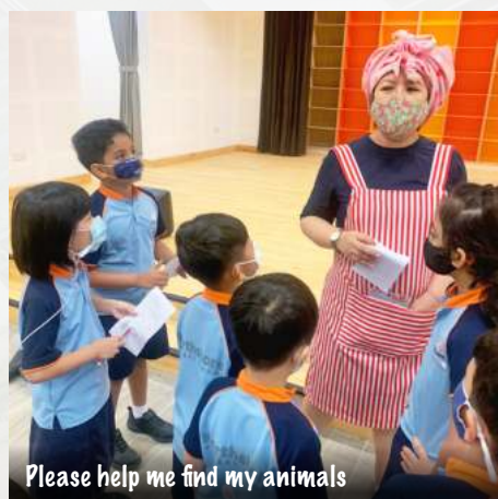
Please help me find my animals