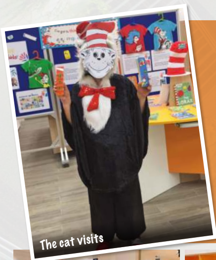
The cat visits