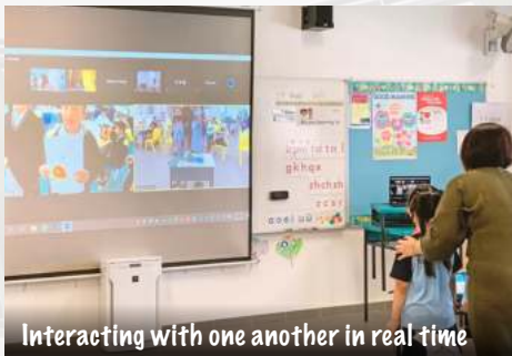
Interacting with one another in real time