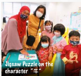
Jigsaw Puzzle on the character “牛”