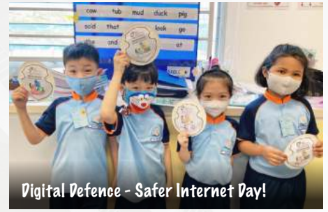
Digital Defence - Safer Internet Day!