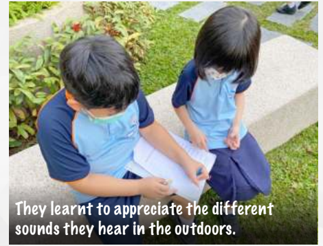
They learnt to appreciate the different sounds they hear in the outdoors.

All students went through the outdoor education sessions in Term 1 where they learnt to use their five senses to appreciate their surroundings. The sessions cultivated their social-emotional competencies such as self-awareness while learning to appreciate being in the outdoors. In Term 2, students went through a series of sports and games sessions. They learnt to play various forms of games such as cooperative games like Builders and Destroyers, and target games like bowling. The sports and games sessions also taught them skills such as perseverance and relationship management.