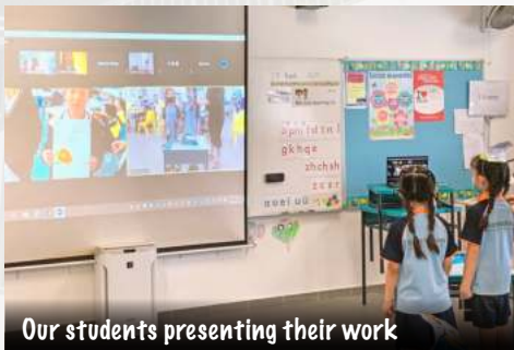
Our students presenting their work