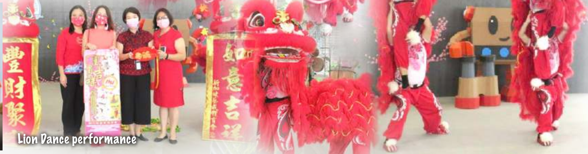
Lion Dance performance