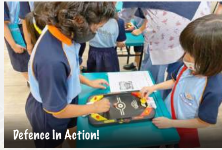
Defence In Action!