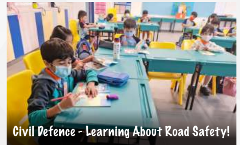
Civil Defence - Learning About Road Safety!