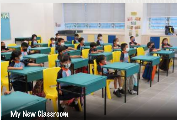
My New Classroom