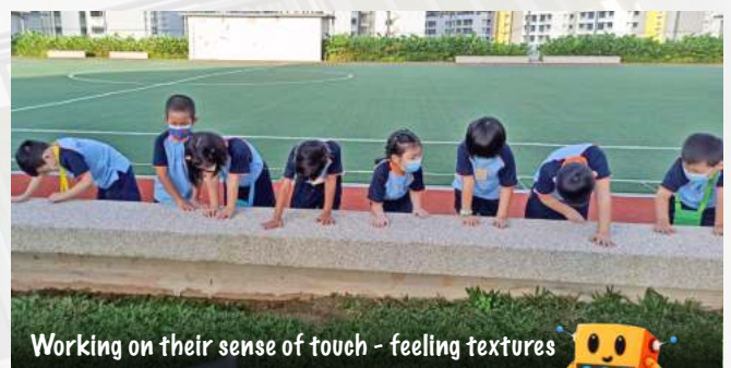
Working on their sense of touch - feeling textures