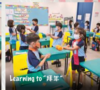
Learning to “拜年”