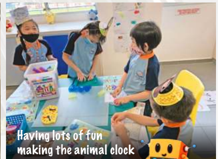
Having lots of fun making the animal clock