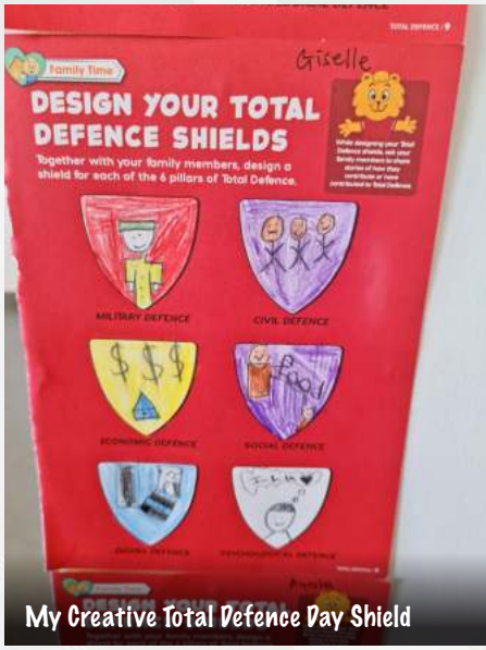
My Creative Total Defence Day Shield