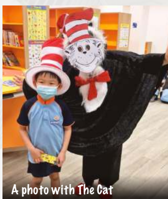
A photo with The Cat