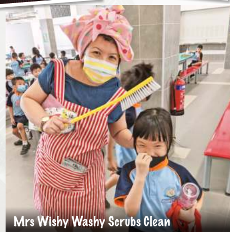
Mrs Wishy Washy Scrubs Clean