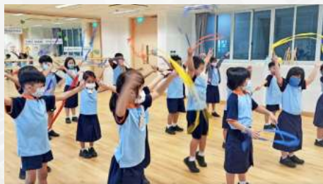
Preparing for a Chinese New Year dance