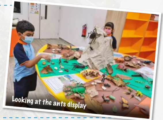
Looking at the ants display

After reading the story 'Ants in a Hurry', the students could not wait to find out more about ants. There were various displays showcasing the life cycle of ants and other creatures as well as giant insects. Did you know that there are more than 12000 species of ants and a single ant can carry 50 times its own bodyweight? The students also learnt that ants don't have ears, and some of them don't have eyes!