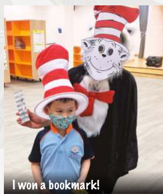
I won a bookmark!