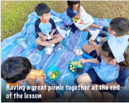
Having a great picnic together at the end of the lesson