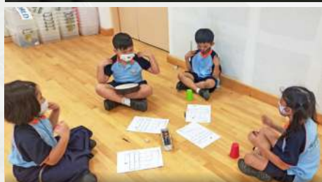
Performing their first music creation