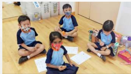
Having fun with music-making