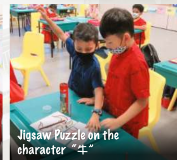
Jigsaw Puzzle on the character “牛”