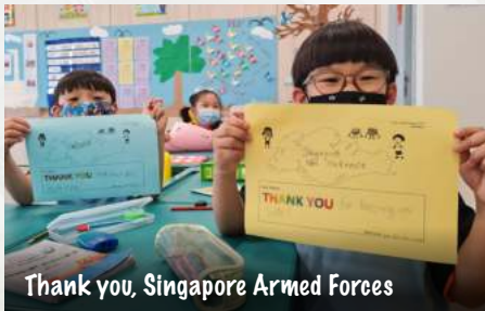
Thank you, Singapore Armed Forces