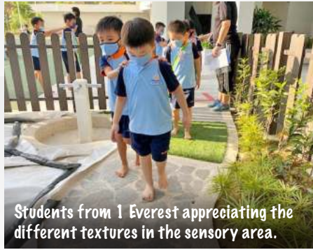
Students from 1 Everest appreciating the different textures in the sensory area.