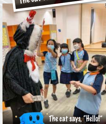
The cat says, "Hello!"