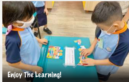
Enjoy The Learning!