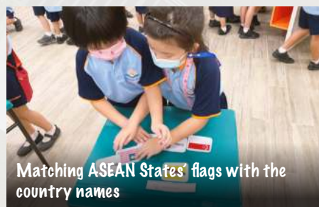
Matching ASEAN States' flags with the country names