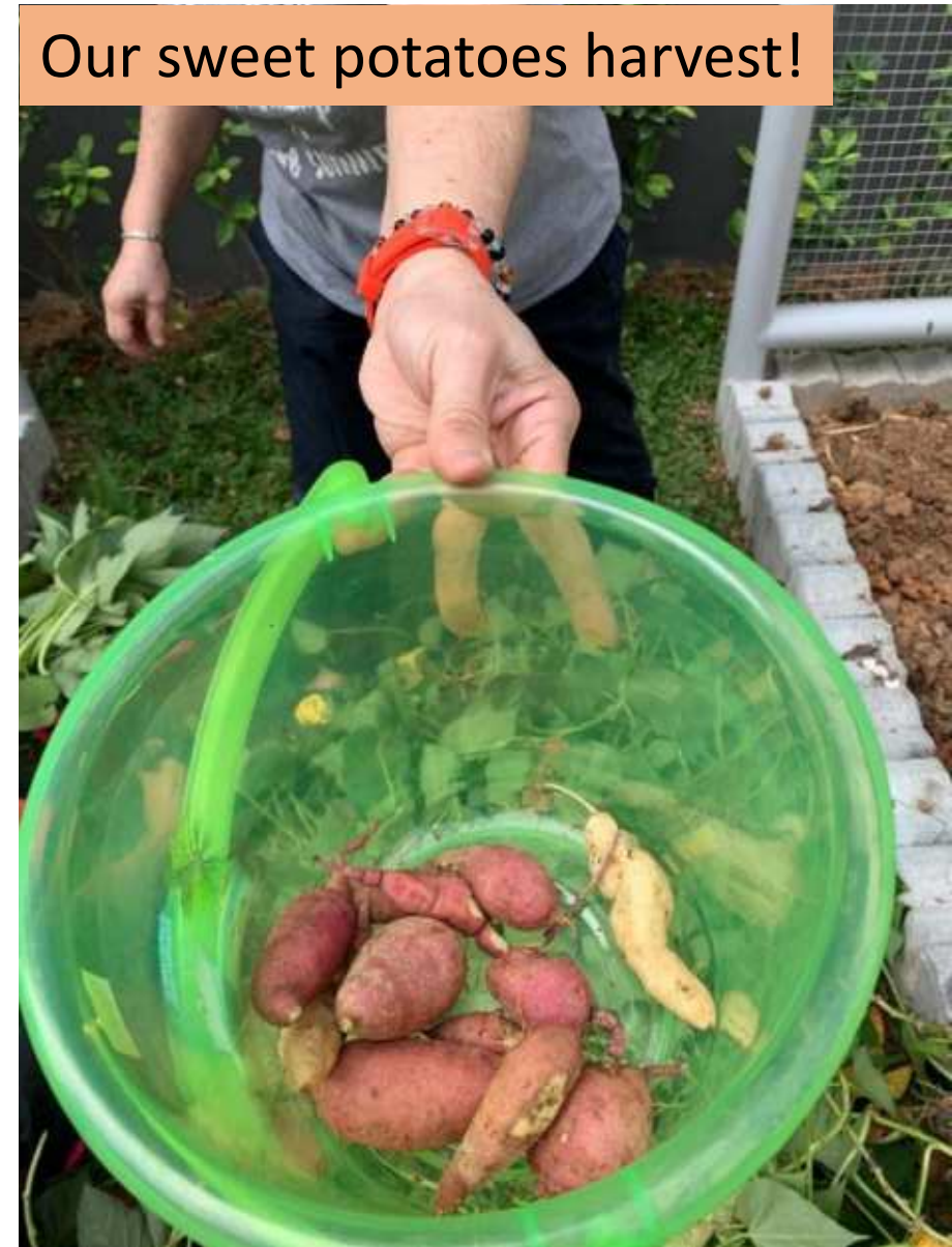
Our sweet potatoes harvest!