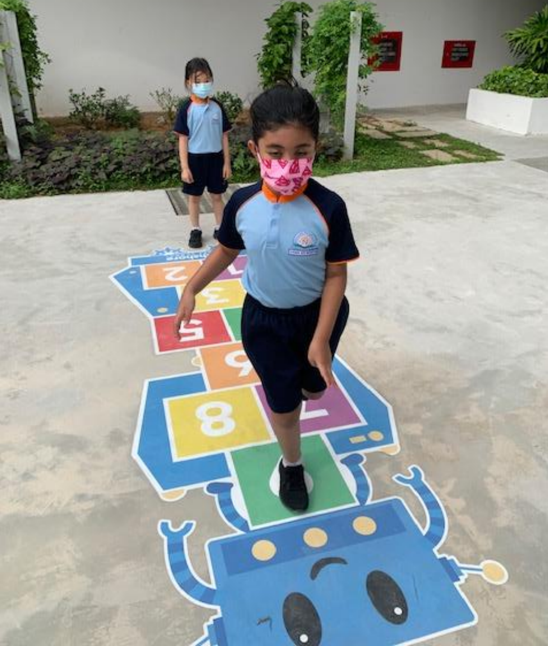
Our outdoor play area for students - hopscotch